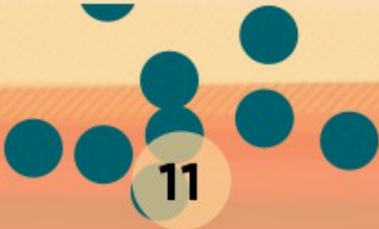
All national courts