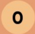
Administrative and criminal law courts only