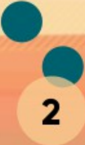
The highest national courts only