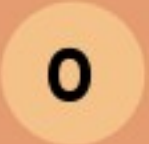
Only courts against whose decision there is no judicial remedy